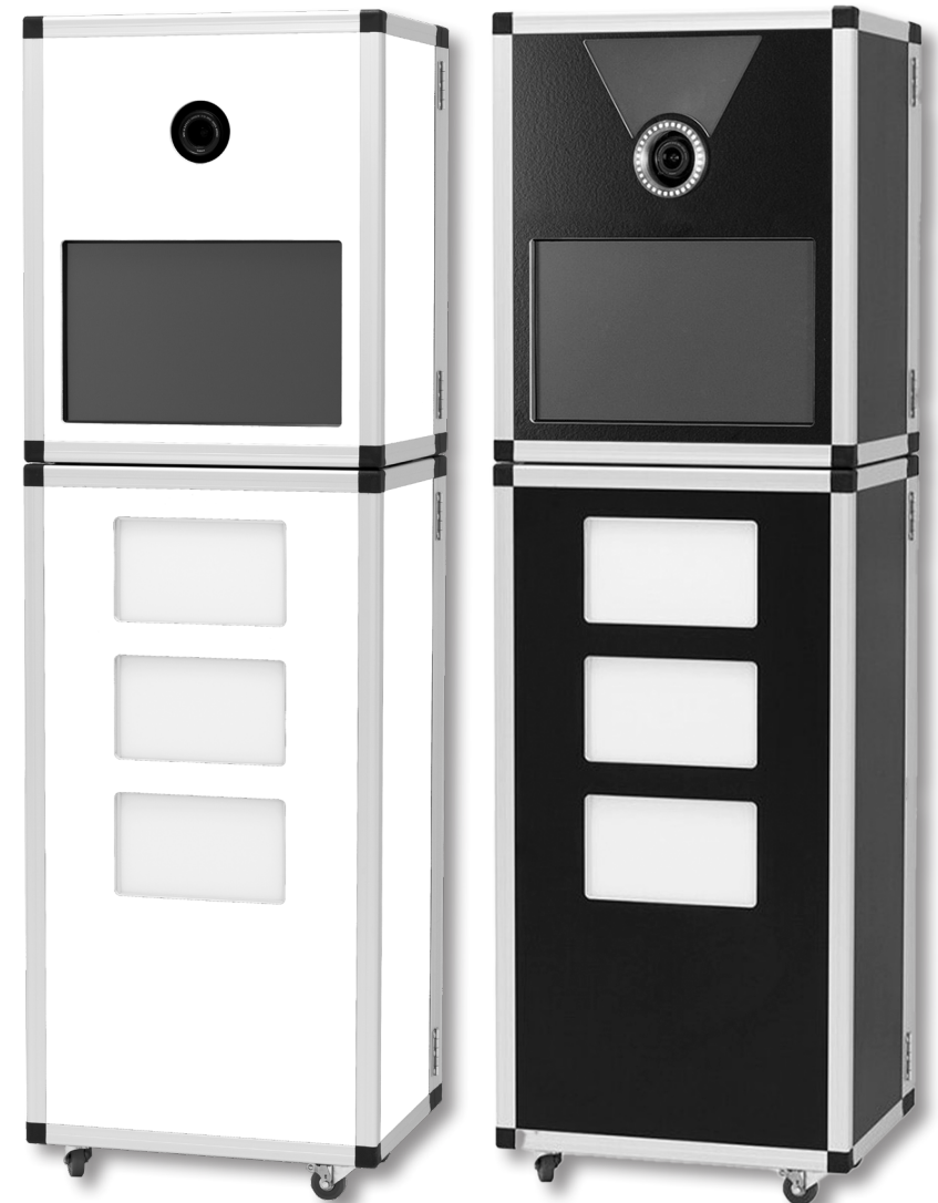
PHOTO BOOTH MODEL MÜNCHEN